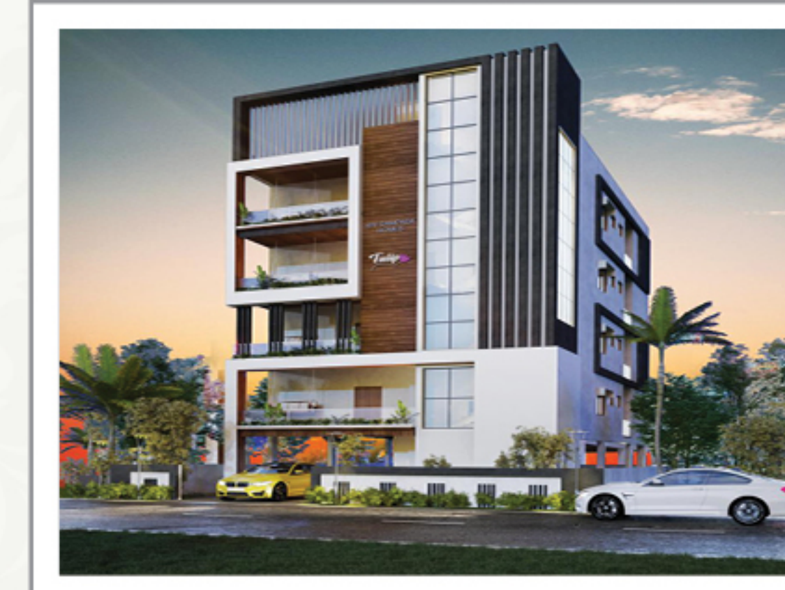
Tulip 3 BHK Flats @ FCI Colony Vanasthalipuram