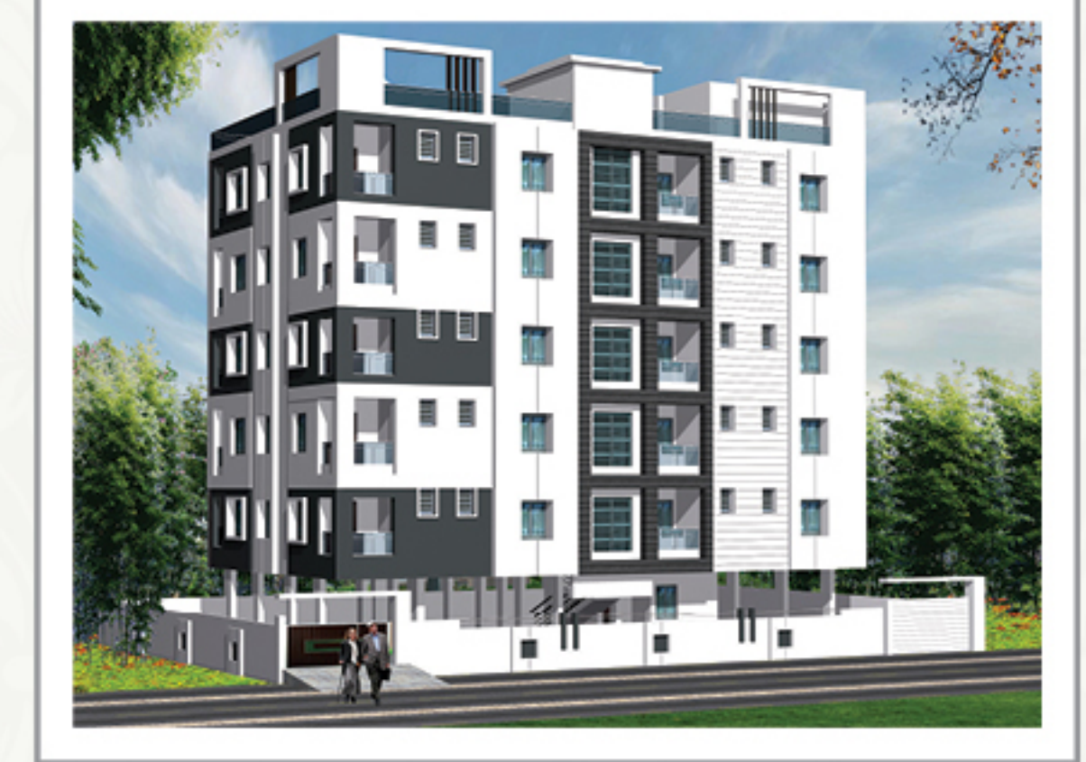
Shree Nivas @ Venkateshwara Colony, Hasthinapuram.