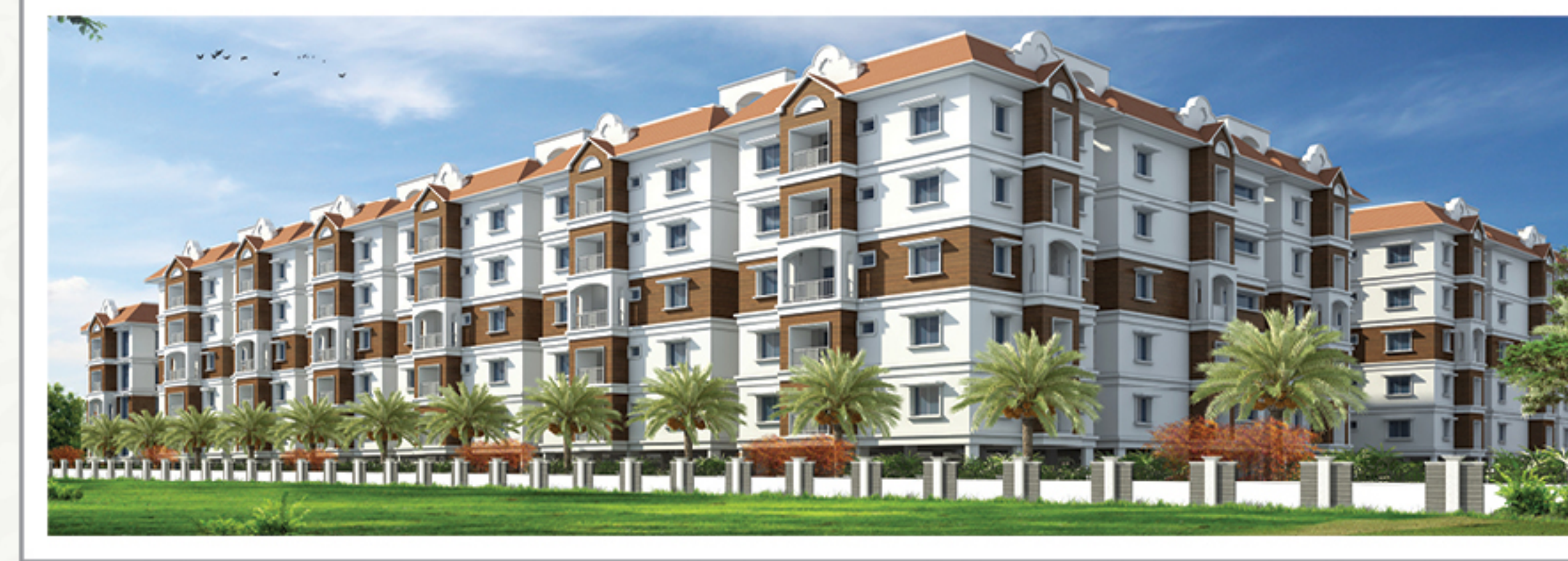
Vision Cascade Greens @ NCL North, Kompally.