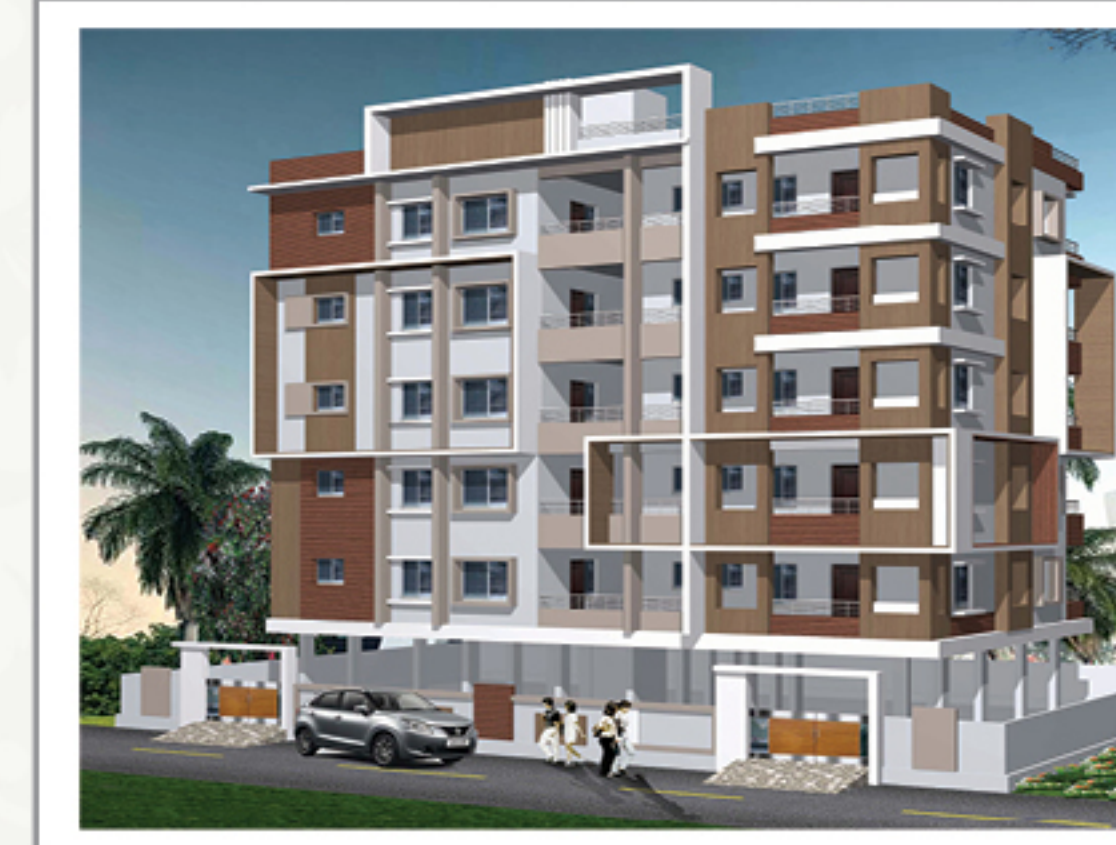
3 BHK Flats @ Nandi Hills near TKR College Karmanghat